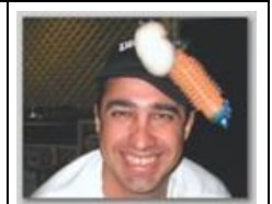
Web Wanker Flatulence