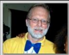
Grand Master Parasite