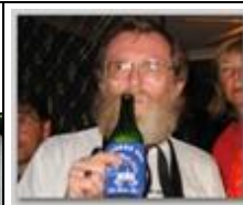
Trail Master Hash Twat