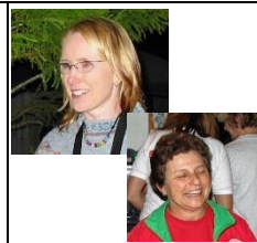
OnSex / Hash Trash Stress Relief / The Monarchist