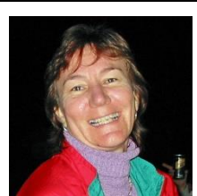
Hash Flash ExposHer